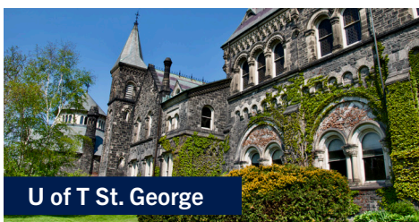
U of T St. George