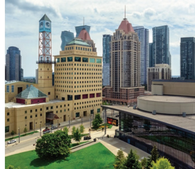
Mississauga's Living Arts Centre and City Hall.