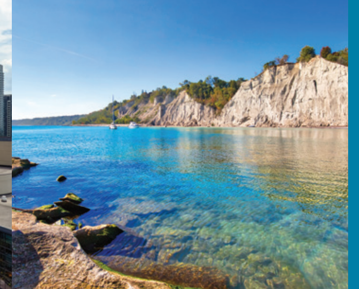
Scarborough Bluffs overlooking Lake Ontario.